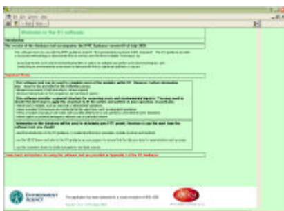
H1 screening software